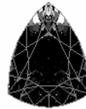
Dispersion = 7.8 %