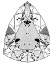
ISO = 82.7 %